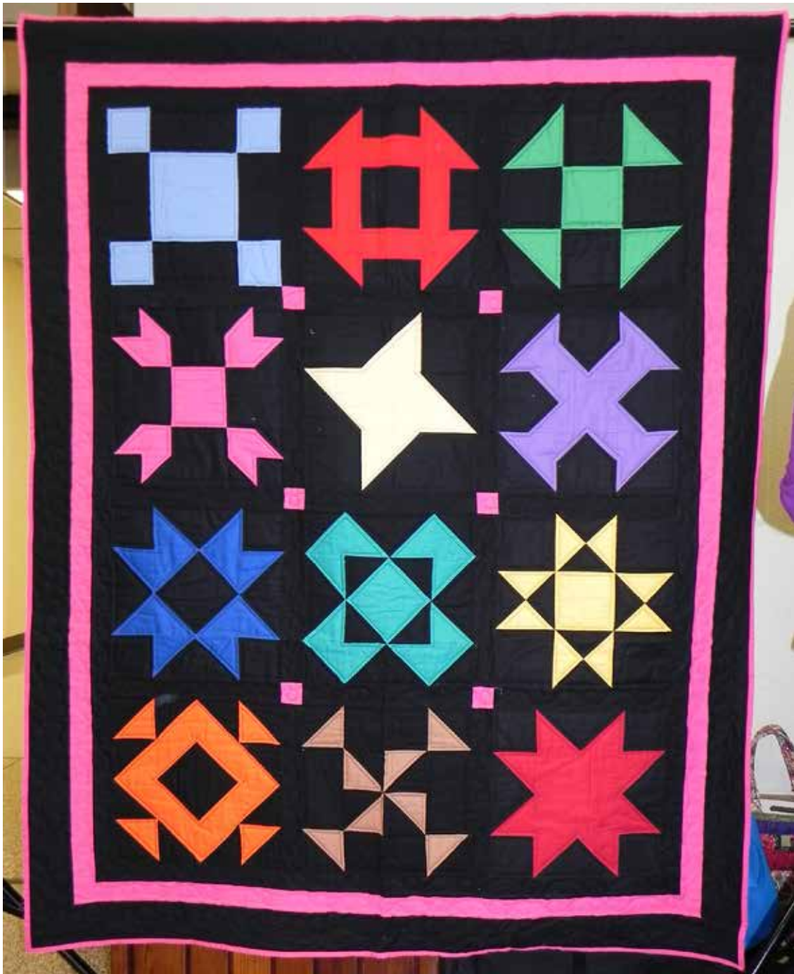
Above is the Block of the Month Quilt for this year.