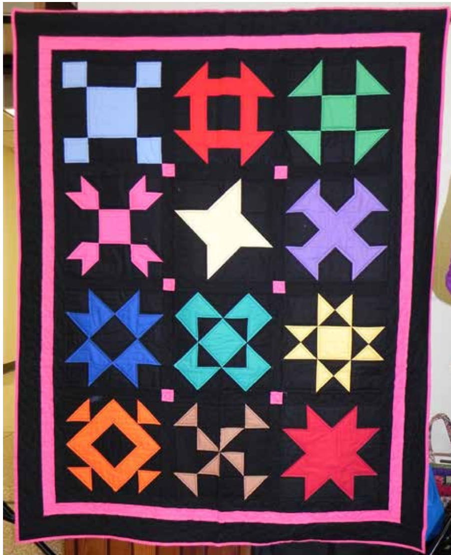
Above is the Block of the Month Quilt for this year.