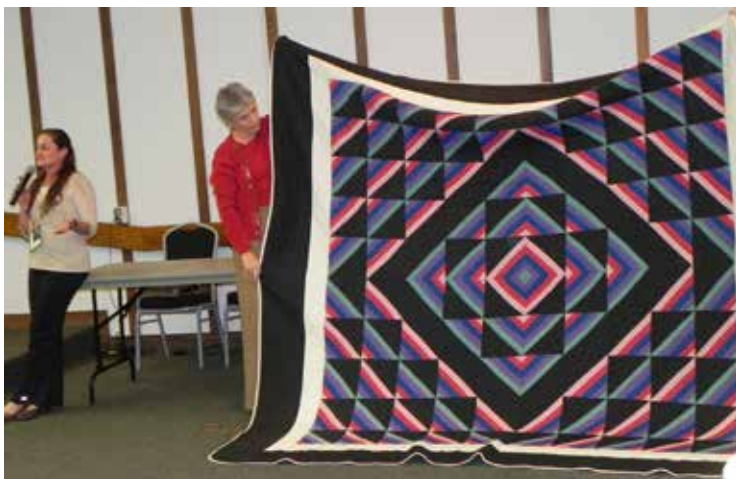
Brazos Bluebonnet Quilt Guild