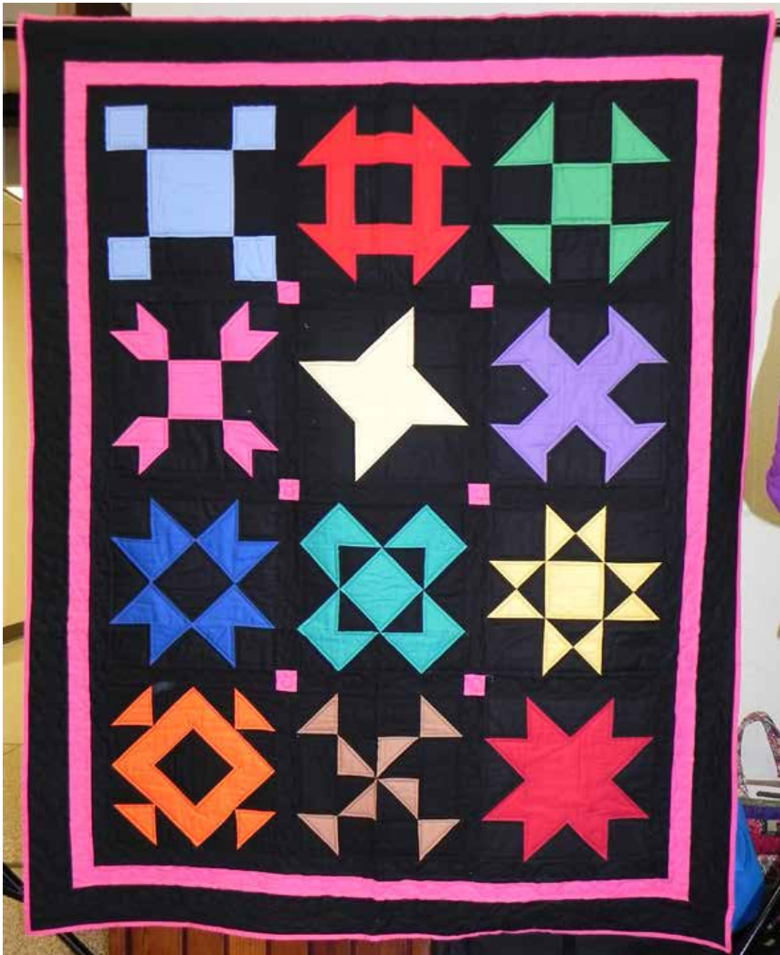
Above is the Block of the Month Quilt for this year.