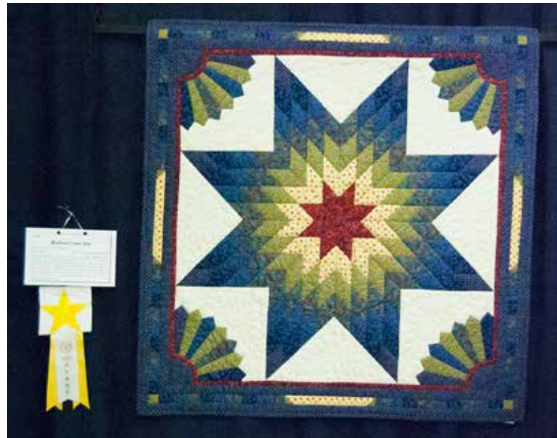
Above, the Viewers' Choice Award went to "Radiant Lone Star," which also was Third Place in Theme Quilts, shown by Lou Ellen Hassold

Once you're in the folder, click on the photo you want to download. In the bottom right-hand corner, you'll see three little dots. When you hover over those, it should say "More Actions." Click that, and the option to download the image will pop up. When you click download, you should have the option to save the photo on your computer.