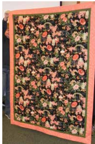
Left, Barbara Mes's quilt at March's Show 'n Tell

Ready to submit? More details are available at mqg-callforquilts.com , where you can also start the application process.