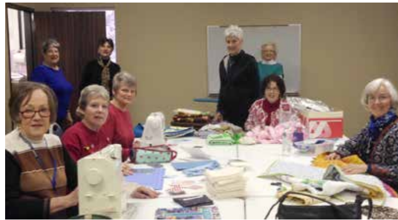
Above, Quilt 'N Peace Bee members