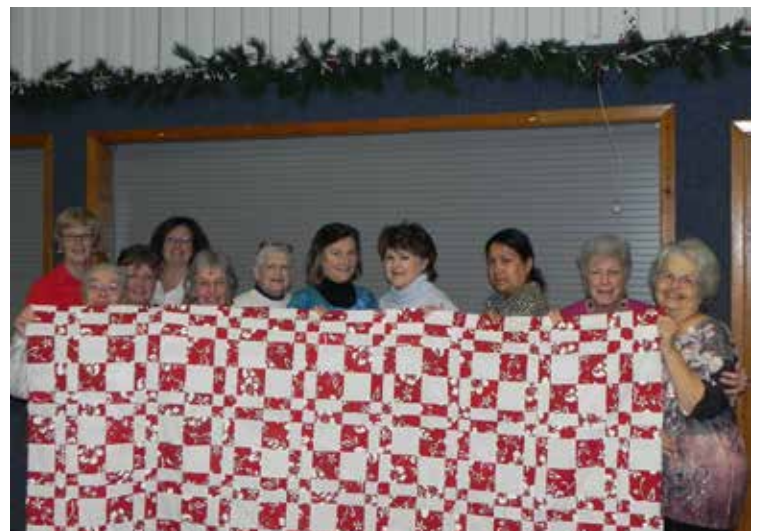
Above, Praying Piecers Bee members on February 23 with their almost-finished quilt for owners of the next Franklin Habitat for Humanity house