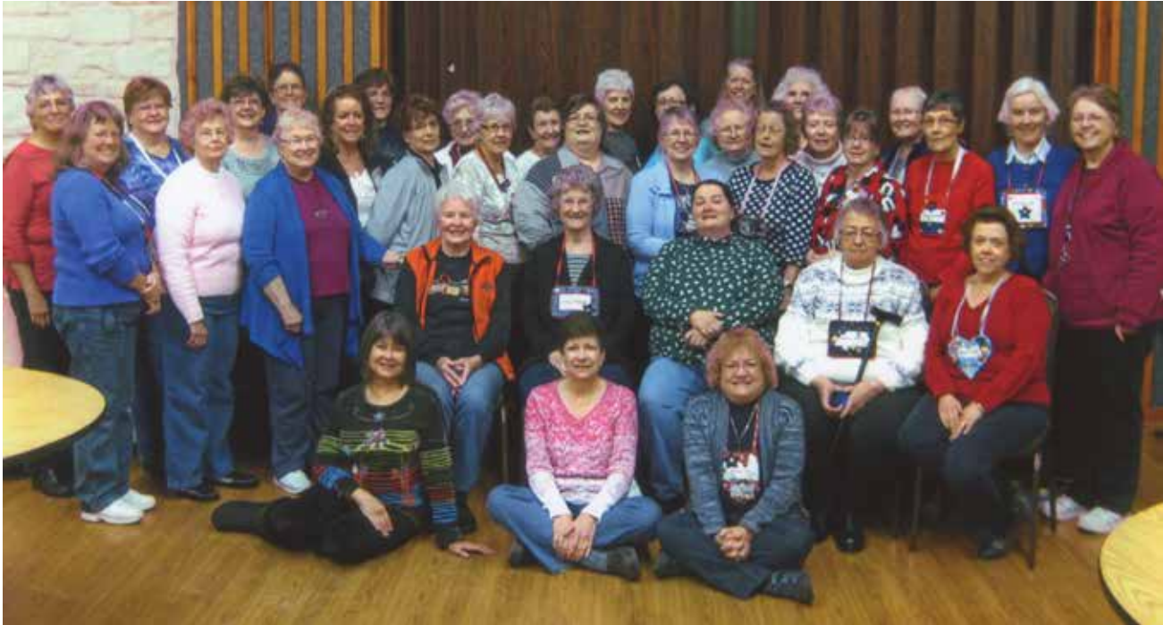
Right, Winter Retreat participants