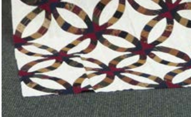
Below, the ladies from St. Mary's Quilt Show brought their donation quilt and information about their Second Annual Quilt Show which will be held on April 29 - 30. A number of BBQG quilters attended last year and were enthusiastic about this show.