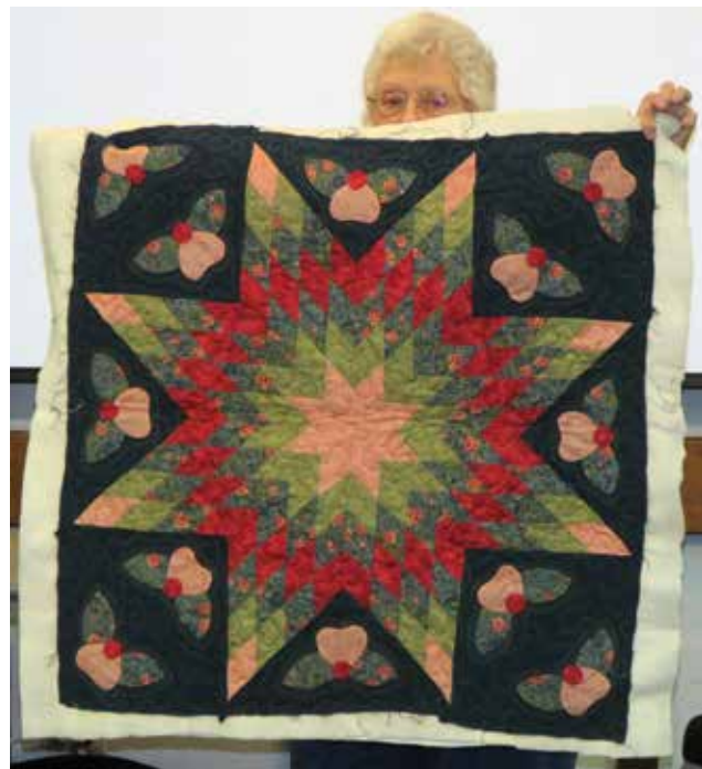
Above, one of two quilts shown by Vera Mohr at to 5/10 Show and Tell.