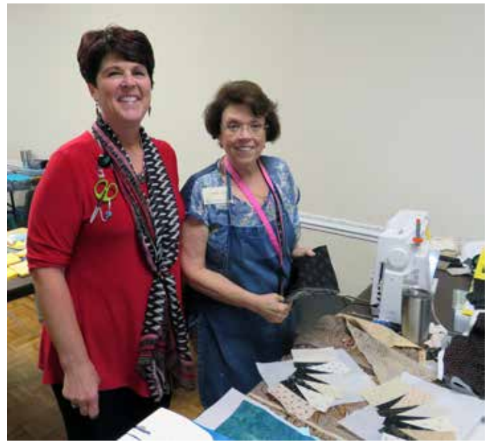
At the workshop on Oct. 12: