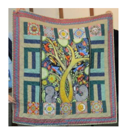
Figure 3 Charles Gilreath Books in a Blanket