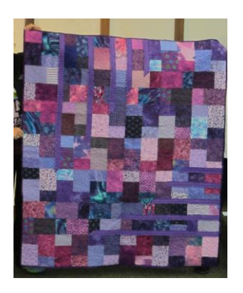
Figure 2Carol Laughlin's Twice Sliced Purple Thing