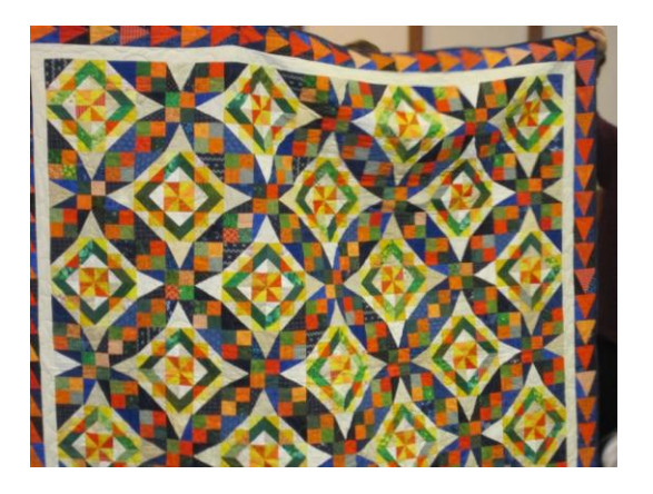
Figure 8 Nicole Pavel's Celtic Solstice quilt