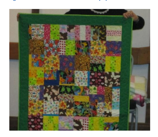
Figure 7 Care quilt from the Quilt N Piece Bee