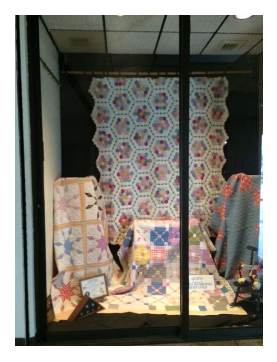
Figure 1New quilt display at the Brazos Center thanks to Bunny Douglas

(979) 595-1072 FAX (979) 595-1074 Ionestarquiltworks@suddenlink.net