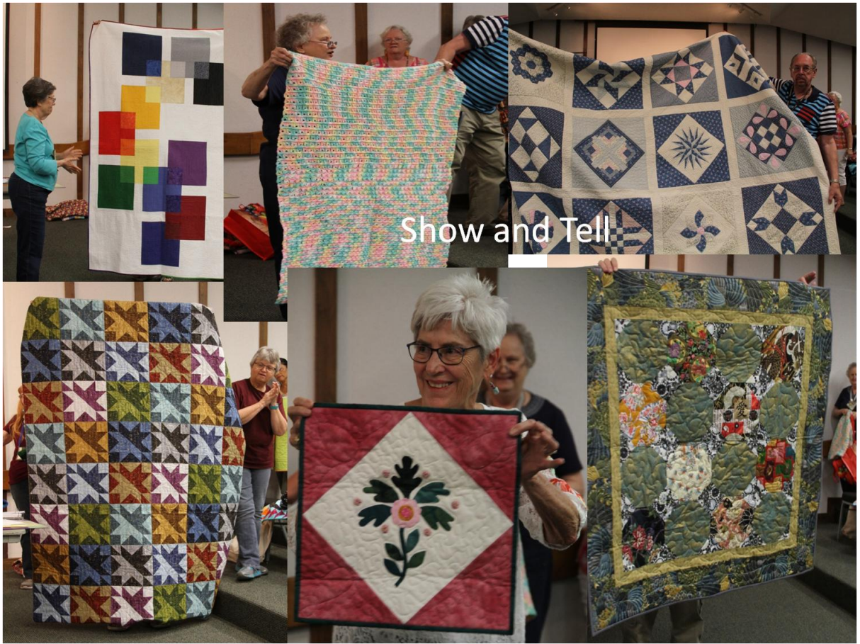
Show and Tell