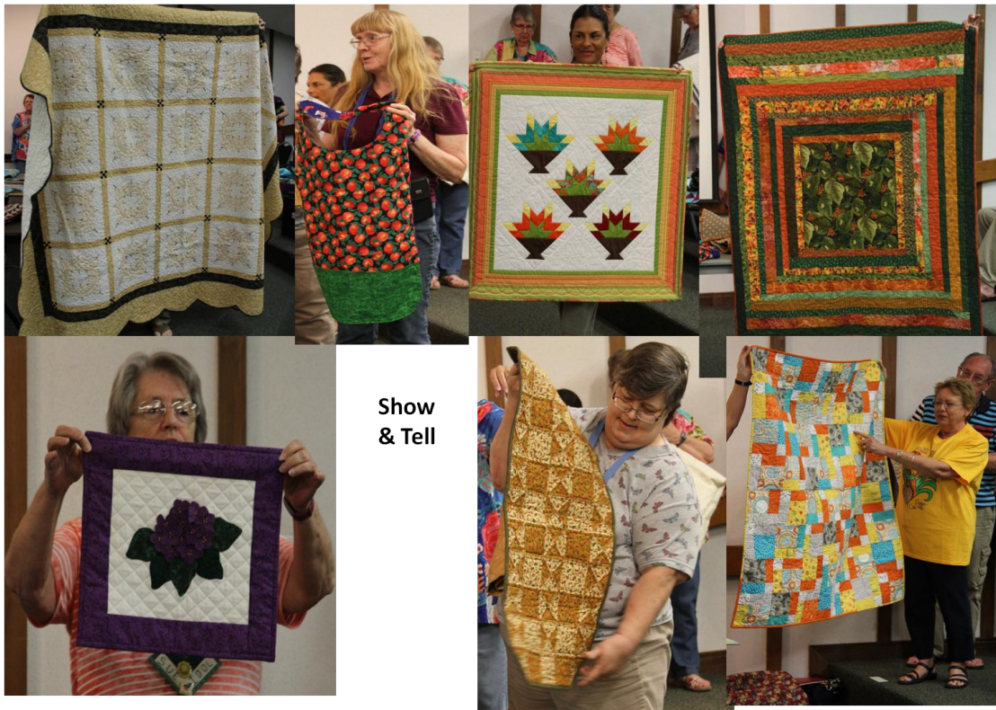
Show & Tell